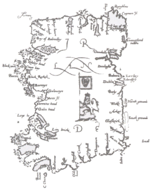
Source B: A sixteenth century map of Ireland similar to the maps used by the Spanish