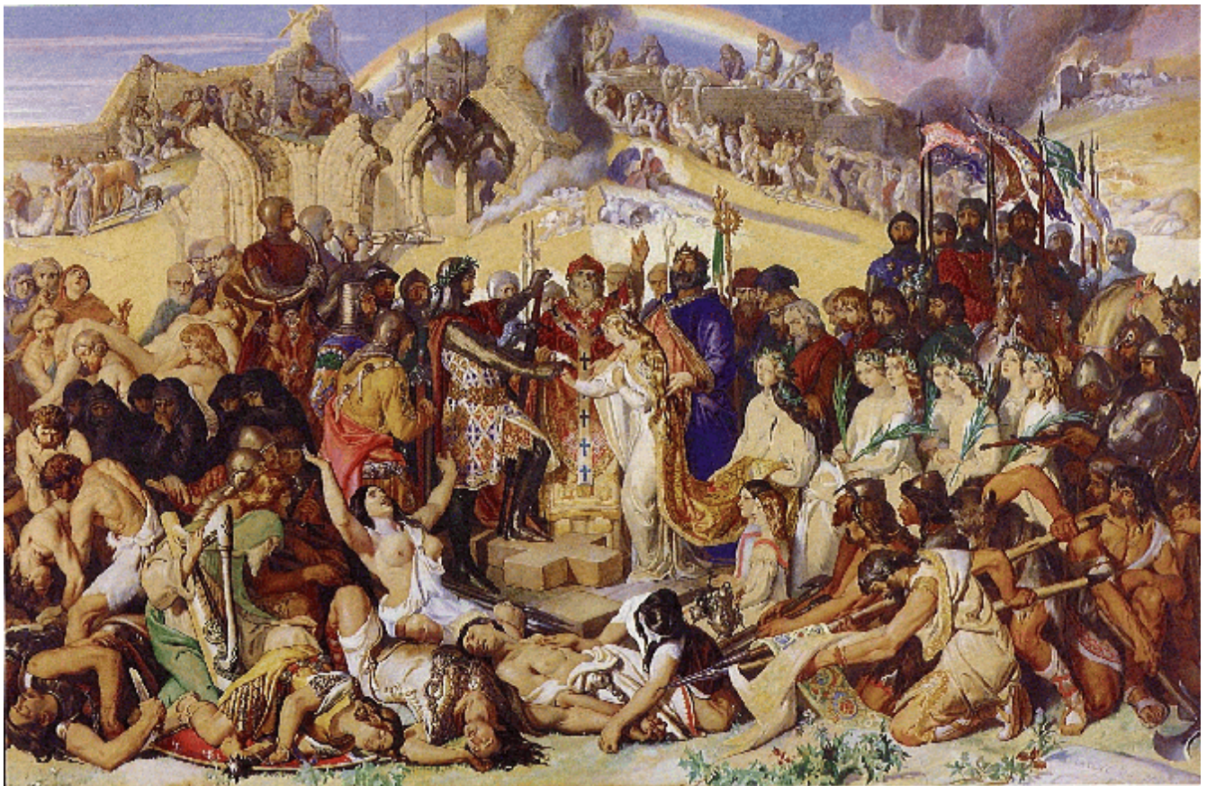
The Marriage of Strongbow and Aoife by Daniel Maclise, 1854